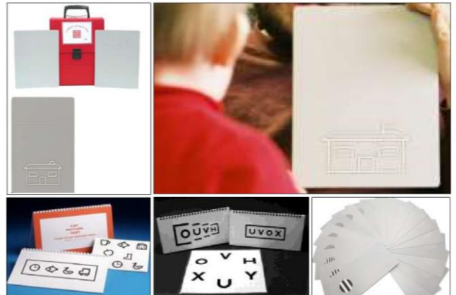
Test to measure children's level of vision: Cardiff Acuity Test and Cardiff combined contrast sensitivity test, combined grating test, Keeler LogMAR and Kay pictures.