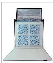
Test to assess the children's three dimensional vision and perception of depth