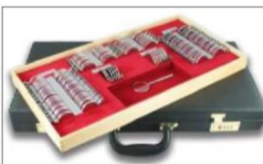
Equipment to estimate the power of spectacles needed by the children: trial frame, Retinoscope and trial lens case