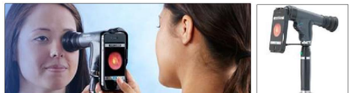
Equipment to obtain images of the children's back of the eye and examine their eye health: Panoptic with phone and adaptor.